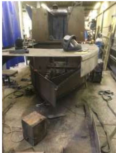
Works undertaken to Canal & River Trust workboat, Mere (left and right)

For more details about our boat maintenance services please visit www.aqueductmarina.co.uk/narrowboat-maintenance and take a scroll down.