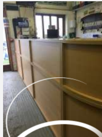
The re-vamped chandlery

Over the past couple of months, we have been busy revamping the Chandlery, clearing counters, moving shelves and reorganising products. Make sure you call in and take a look!