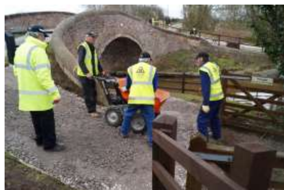
Work well underway