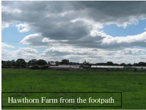
Hawthorn Farm from the footpath

Cross the stile and follow the hedge on your left into the next corner. Cross a stile in the corner and follow the hedge, now on your right. At the end of this hedge is a stile onto a farm track. Cross the stile and turn right to follow the track. A little way along the track you will see a stile on your left. Cross this stile and turn right towards the fences left by the pipeline installation. There are stiles across these pipeline fences