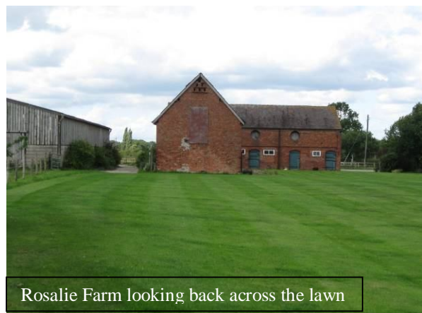
Rosalie Farm looking back across the lawn

Cross the stile, descend the steps to the towpath, turn left so that the canal is on your right and retrace your steps to Aqueduct Marina.