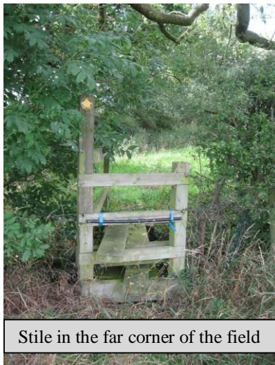
Stile in the far corner of the field

ahead with the hedge on your right. You will pass two large oak trees in the hedge and then reach a gateway into the next field on your right. Stop at the gateway, turn to your left and walk straight across the field to the gates and stile on the other side, situated to the left of the farm buildings of Cholmondeston Hall.