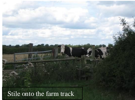
Stile onto the farm track

by the hedges (cross one in the corner of the field and then the next alongside the hedge leading to the left) and then a double stile out of the field. Walk straight ahead, keeping the hedge on your right, towards Rosalie Farm. There is a stile onto the road by the entrance to Rosalie Farm.