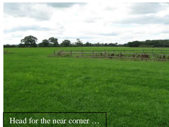
Head for the near corner ...

Starting at Aqueduct Marina, walk down the drive and turn right at the road. Walk to the canal bridge and descend the steps to the towpath. Turn right at the bottom of the steps so that the canal is on your left, and walk under the bridge towards Minshull Lock. Continue past the lock and the next bridge, then climb the steps under the high level, black and white bridge, Brickyard Bridge. Cross the stile into the field and walk straight