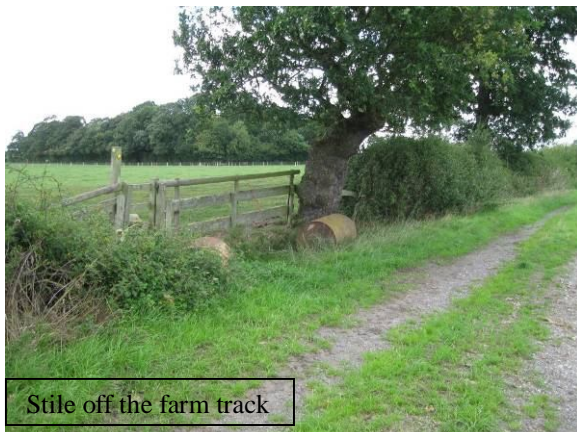
Stile off the farm track

When you reach the road, turn into the drive